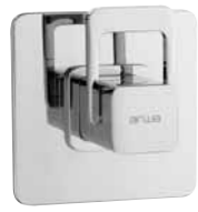
Flush-mounted mixer without diverter 9.71700