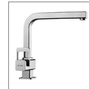
Sink mixer with swivel spout 9.79532