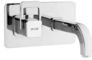
Flush-mounted mixer 9.75480/9.75485