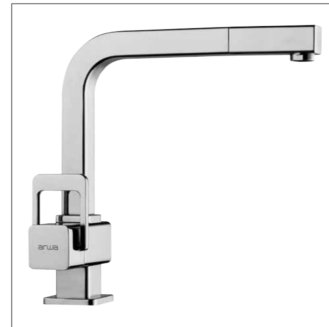
Sink mixer with pull-out spout 9.79673