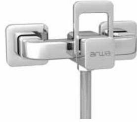
Shower mixer 9.71130