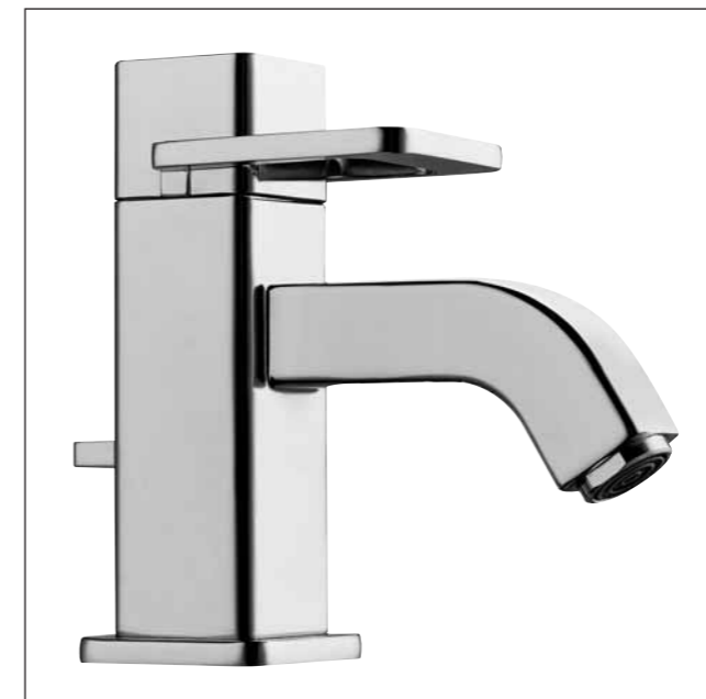
Washbasin mixer with 110 mm fixed spout 9.78827, also available with 130 mm spout 9.78837 and as a column mixer (height 321 mm) with a 130 mm spout reach 9.78885