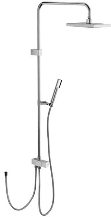
Shower station 9.71113