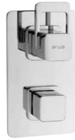
Flush-mounted mixer with diverter 9.70700