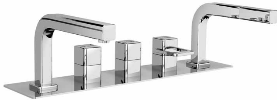
Bath filler combination, 5-hole with deck-mounting plate 9.20663, also 4-hole for separate spout, each available with or without plate