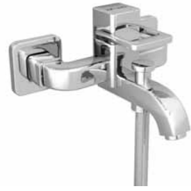
Bath mixer 9.70110