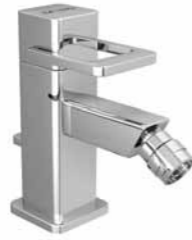
Bidet mixer 9.78100